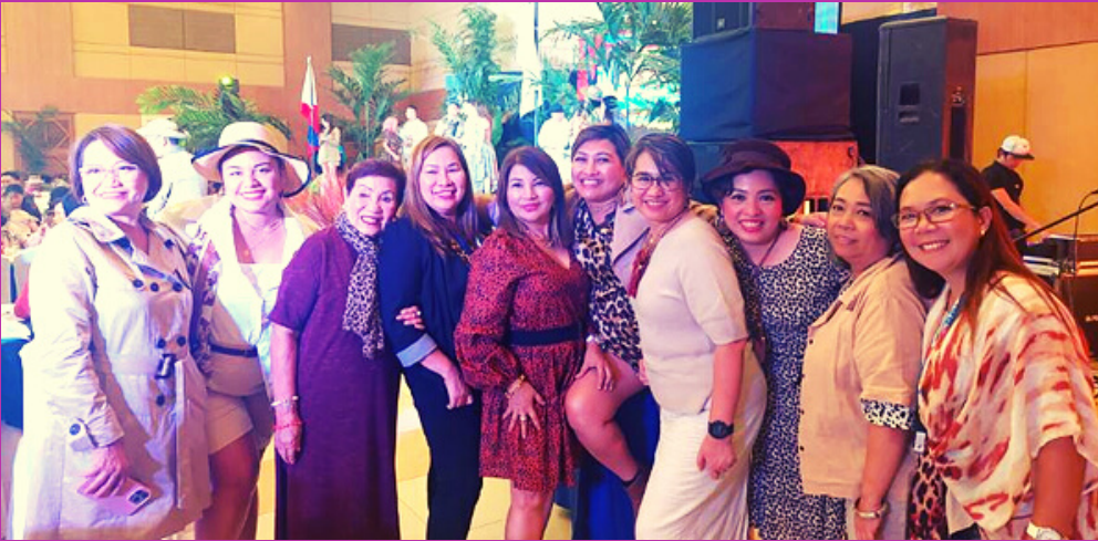
Safari Night DTA Felloship at Panglao Island, Bohol